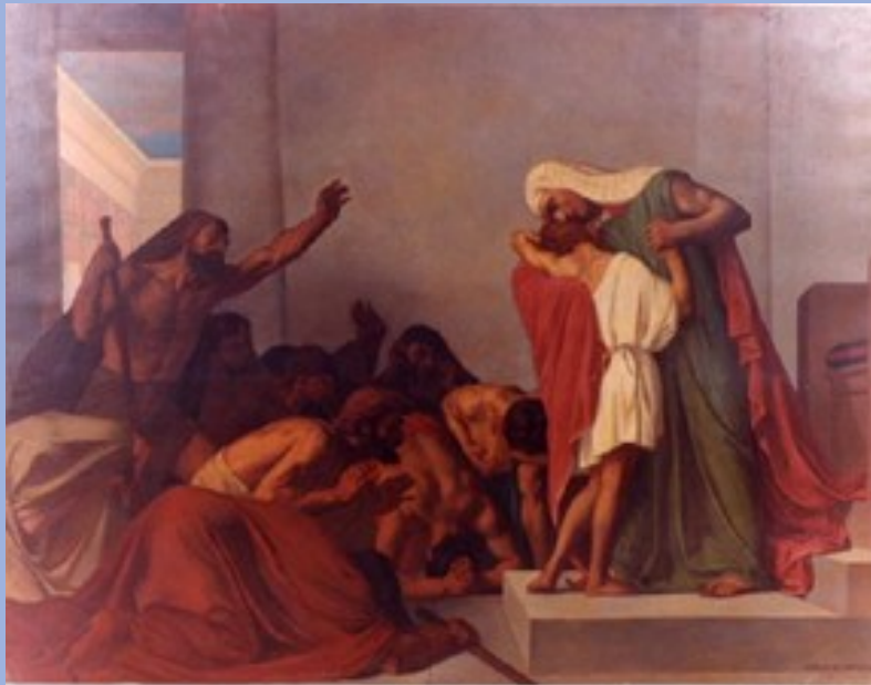
Joseph recognized by his brothers (Genesis 45) (Léon Pierre Urbain Bourgeois, 1863)

www.standrewskentct.org * 860.927.3486 * st.andrew.kent@snet.net